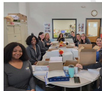
HUB staff volunteering with Connecting Kids to Meals in September.

The Northwest Ohio Pathways HUB (the HUB) connects low-income residents to needed medical and social services in Northwest Ohio. The HUB was awarded more than $2.6 million in funding and managed 21 grant projects in 2024. Putnam County Health Department and Salem Lutheran Church joined the HUB's care coordination network, expanding services to 15 agencies throughout the Northwest Ohio region. Housing remained a large barrier for many Pathways HUB clients, and the Hospital Council obtained grant funding to expand housing assistance to homeless youth receiving home visiting services in Northwest Ohio. In 2024, HCNO's growing housing assistance program provided more than $143,000 in assistance to 211 local families.