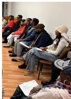
Participants at a Queens Village event.

Queens Village Toledo remains a pillar of support for Black women in Lucas County while combating high infant mortality rates. The supportive community hosted 42 in-person events and sold over 1,000 event tickets to foster community, relieve chronic stress, and improve maternal health outcomes. Six of the events specifically catered to new and expecting mothers, offering a space to find community, access valuable pregnancy and parenting information, and receive wellness supplies. Accessibility to events remained a priority—over 250 Lyft rides were scheduled, and childcare services were provided to remove participation barriers. Queens Village assembled 50 care packages to support families in the NICU and launched a Patient Empowerment Toolkit to equip individuals with self-advocacy tools and local resources. Community health workers at 11 organizations across Lucas County shared the toolkit.